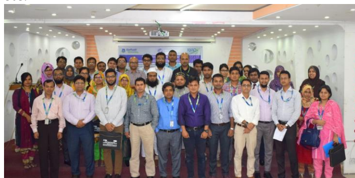
Guests and Participants of the training programme

After the inaugural session, the key facilitator conducted the session on “Curriculum Design Based on Outcome”. In that session, he highlighted the issues like: Articulation of Vision/Mission/PEO, Program Outcomes (POs), CO writing, Gap Analysis, CO and course content revision, Revision of structure of courses, Key points, Course Outcomes (CO) to Program Outcomes (PO) mapping. After the lunch break, the key facilitator conducted another session on “Teaching and Assessment Based on Outcomes” where he emphasized on: Outcomes Driven Learning Activities, Final Year Design Project, Assessment of Outcomes Achievement, Rubrics for Assessment, Constructive Alignment, Continual Quality Improvement (CQI) and Bloom's Taxonomy of the Cognitive Domain etc.